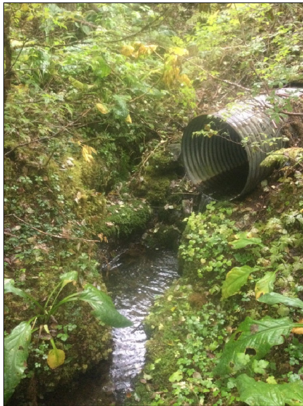
Figure 3.—Perched culvert outlet at waypoint 1825.