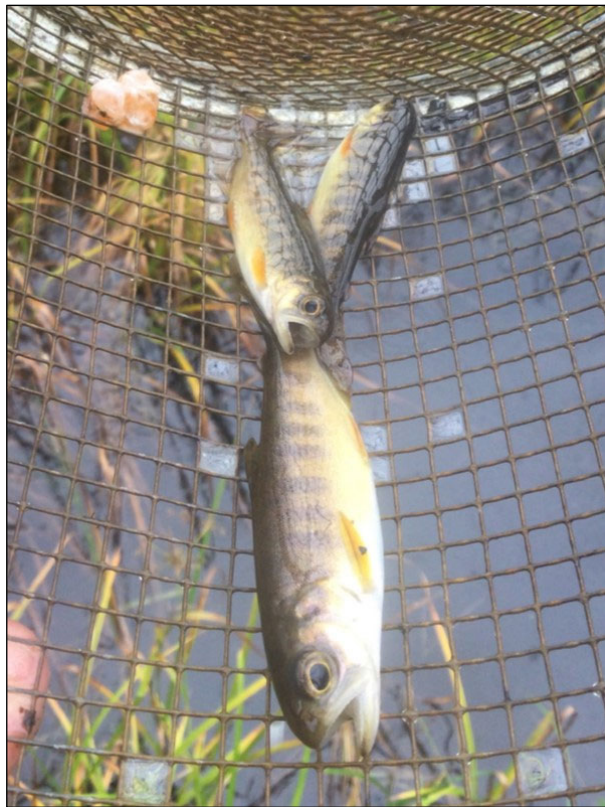
Figure 2.—Juvenile coho salmon captured at waypoint 1823.