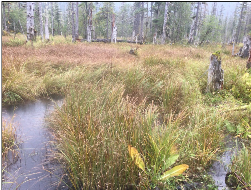
Figure 1.—Ponded channel at waypoint 1823.